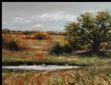
PAINTING OF SURROUNDING AREA BY LOCAL ARTIST