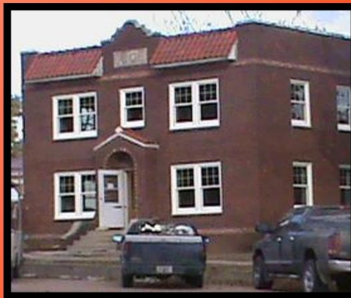
Rice Lodge and Conference Center Most Recent Project

When driving, everyone waves at each other.