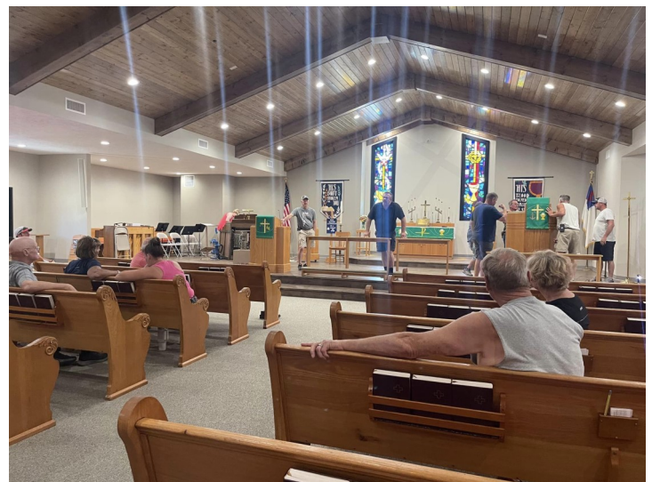
Above Photo: OSL congregation members finish up on Sunday, June 23 to prepare for the dedication of the new building on June 30, 2024.

(cont'd from cover) voted down. In 2000, a proposal to construct a new building that would meet the needs of the current congregation—which included more space for Sunday School classes, more space for the congregation, and handicap accessibility—at an rough estimated cost from a local contractor of $525,000. Not enough pledge commitments were received and it was determined to not have sufficient funding to go ahead with this project. Facilities committees continued to happen throughout the years as the same concerns and needs were there. A handicap ramp was added in 2004, the narthex area, and basement kitchen, and women's restroom were remodeled in 2011. The Sanctuary was renovated in 2013. In the years following this, noticeable movement of the interior walls was observed. The roof was beginning to sag, engineers were consulted and it was determined that the original tile foundation and construction was slowly crumbling, compromising the stability of the roof and entire structure. It was also determined that adding on to this current structure was not possible. In 2018, work was began to see what the current congregation felt were the top needs for Our Savior