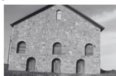
Filley Stone Barn

We have some routine preservation work needed to be done and a future Cottage Hill Outdoor Classroom to be built for future programming. Go to our website to find out more.