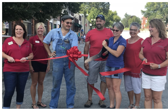
Ribbon Cuttings: Far Left: The Corner. Near Left: Turkey Run Farms. Lower left: Odell Public Library. Congratulations to all of you!