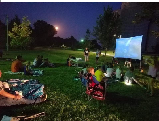
Odell Day ended with a Street Dance at The Corner and a Movie in the Park (shown in photo at left). What a wonderful day! Thank you to everyone! Let’s keep this tradition going!