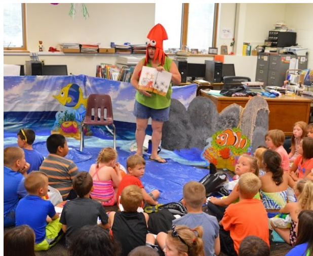
The Summer Reading Program at Diller-Odell Elementary wrapped up on Friday, June 30. See page 7 for more!