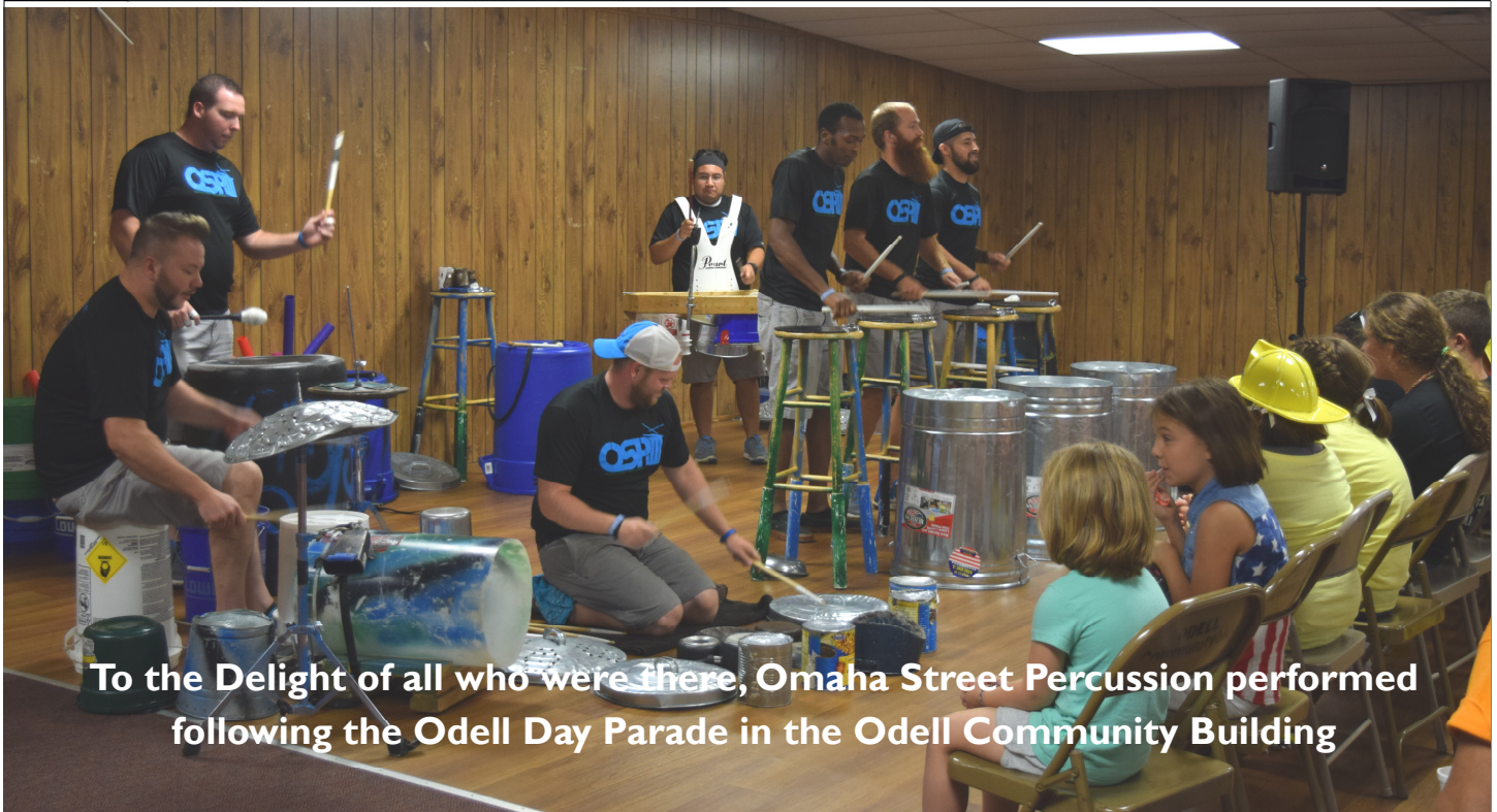
To the Delight of all who were there, Omaha Street Percussion performed following the Odell Day Parade in the Odell Community Building