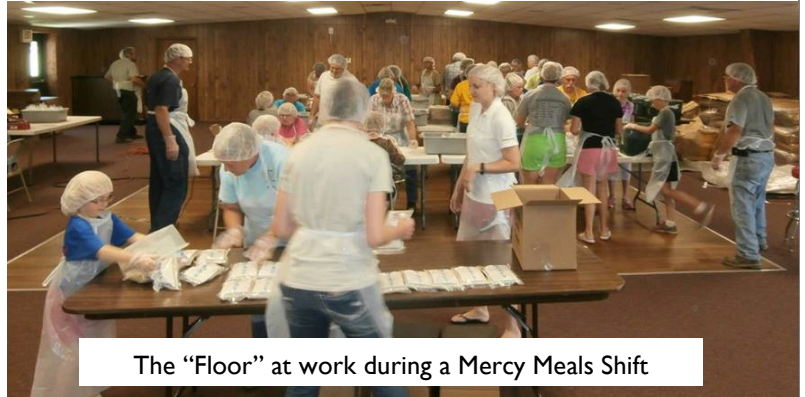
The “Floor” at work during a Mercy Meals Shift

The meals are now in sealed bags with 6 servings in each bag. The bags are being stored in the “Orphan Grain Train” storage container in Odell until Orphan