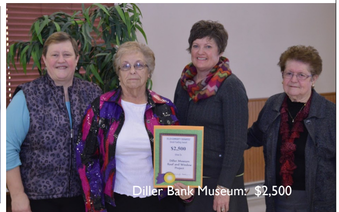
Diller Bank Museum: $2,500