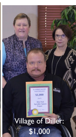
Village of Diller: $1,000