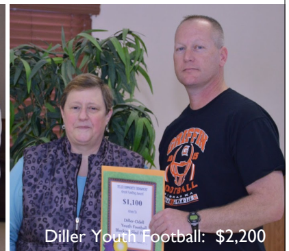
Diller Youth Football: $2,200