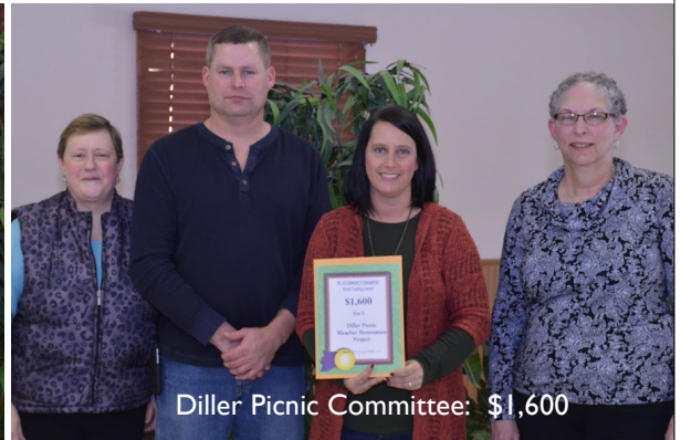
Diller Picnic Committee: $1,600