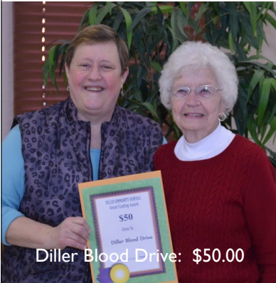
Diller Blood Drive: $50.00