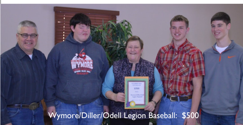
Wymore/Diller/Odell Legion Baseball: $500