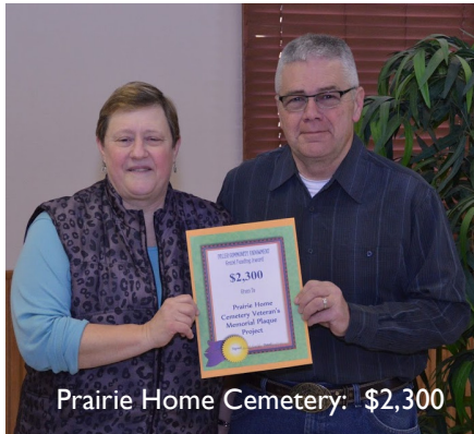
Prairie Home Cemetery: $2,300