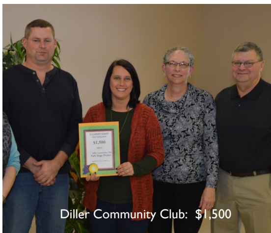
Diller Community Club: $1,500