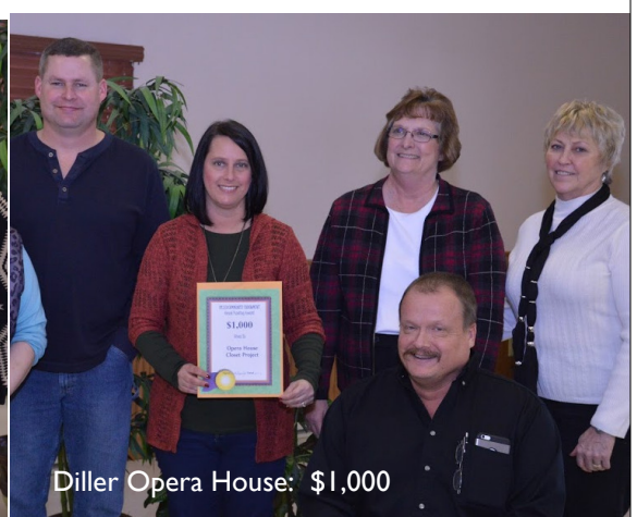
Diller Opera House: $1,000