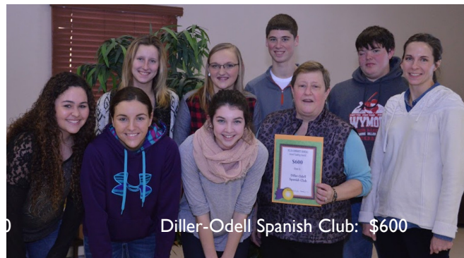
Diller-Odell Spanish Club: $600