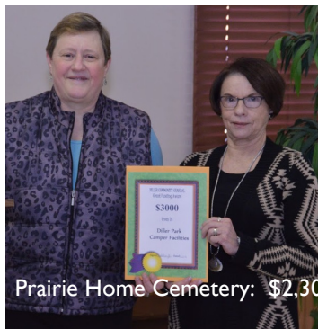
Prairie Home Cemetery: $3,000