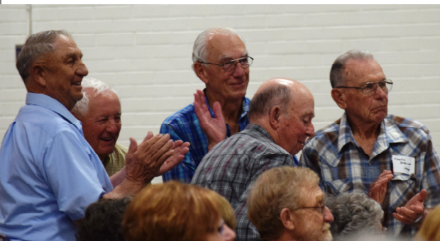
The Class of 1949 Stands as their Year is “Called”